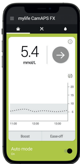
Auto mode activated

Note: Please discuss all recommendations with your diabetes team.